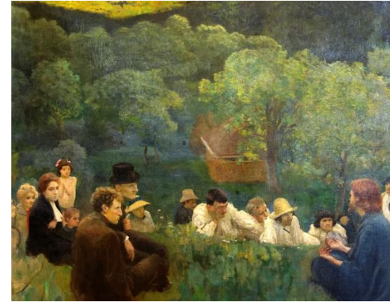
Sermon on the Mount, Károly Ferenczy (1896)