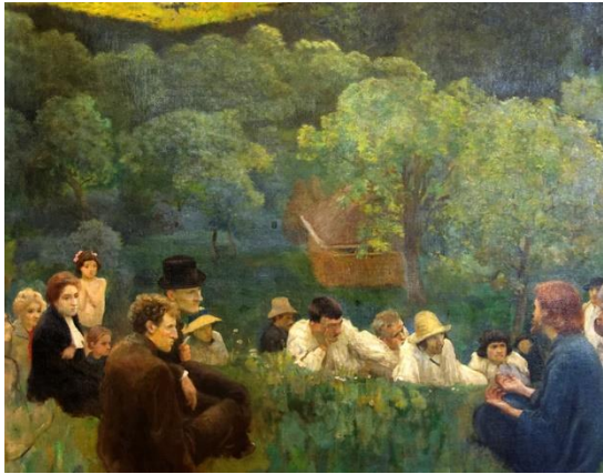
Sermon on the Mount, Károly Ferenczy (1896)