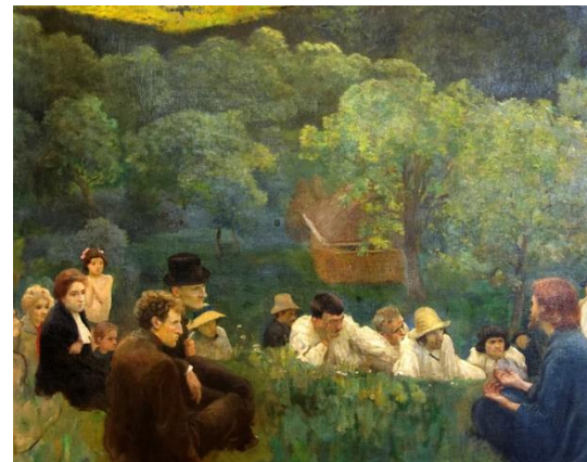
Sermon on the Mount, Károly Ferenczy (1896)