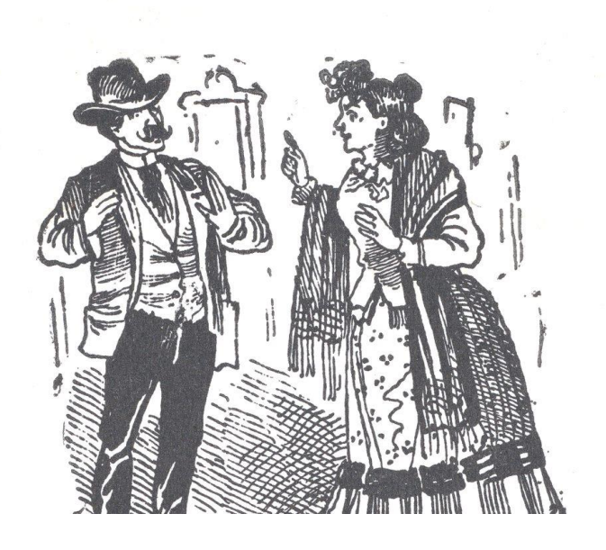
"A woman wagging her finger at a man with his hands raised" ca. 1880–1910, by José Guadalupe Posada.

As human beings, we need to be thinking about others, thinking more about we and less about me. And as Christians we especially <u>should</u> be thinking about the commandment Jesus gives—that we love one another. Besides, what is there not to like about obeying Jesus' new command? Last time I checked it seemed to me that the world could use a lot more Love.